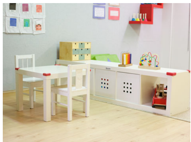
Clarity™ Accent for schools