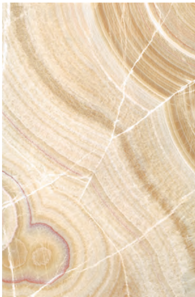
CREAM ONYX C-8