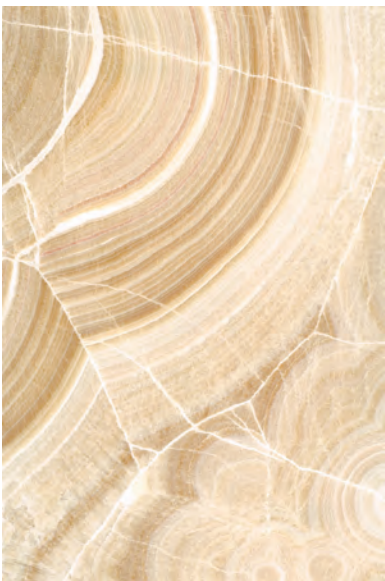
CREAM ONYX B-4