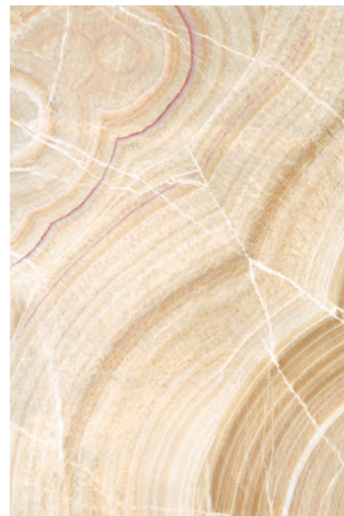
CREAM ONYX D-12