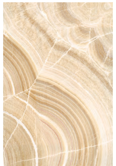
CREAM ONYX B-6

T 1.800.451.0410 | F 412.781.7840 | www.forms-surfaces.com