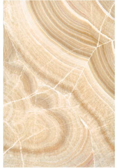
CREAM ONYX A-3