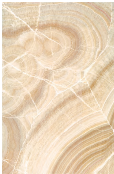
CREAM ONYX B-5