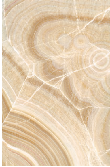
CREAM ONYX A-2