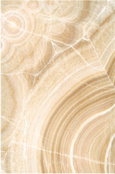
CREAM ONYX A-1

ViviStone Cream Onyx is available in twelve slab options. The size as shown for each slab is 60" x 90", but smaller sections can be specified if desired. The ViviStone Virtual Quarry allows you to select from our collection of ViviStone slabs, assemble and configure a design to meet your project needs, and save your work to return to at any time. To get started visit www.forms-surfaces.com , or to access the Virtual Quarry directly go to www.virtualquarry.com .