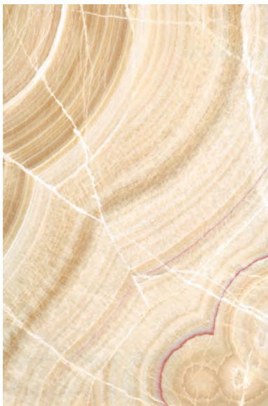
CREAM ONYX D-11